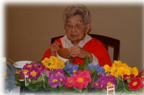
She wants to be a part of something important

It is your support that can help ensure that seniors, individuals with dementia, and those with disabilities residing in our community continue to receive the care and support they need and deserve.