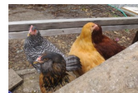
Come by sometime and visit our lovely little ladies!

Lucky, who will bring some variety with light blue and green eggs. The latest project now is building a large coop and a creating a fenced off area for free-range roaming. So far, Corinne and a few of the participants have painted all of the exterior walls of the boards being used for the new coop and plan to assemble it soon. Activities surrounding animals are a very successful form of therapy for people with disabilities and seniors with cognitive impairment, particularly those with Alzheimer's disease. Lucky, Pearl, Rusty, and Butterball have brought smiles to faces, caused eyes to light up, and sparked conversations about times past growing up on farms or raising chickens in their own backyards.