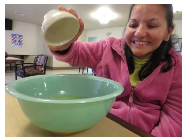
Cooking & Baking