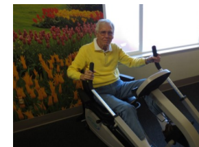
Exercise & Post-Rehabilitation Therapy