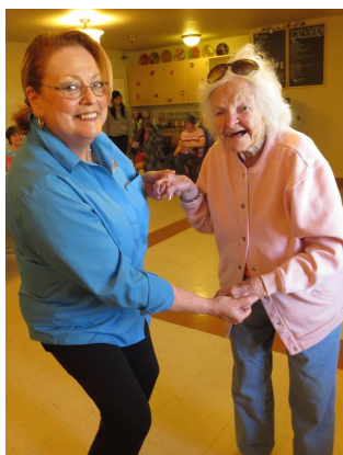
Parties & music therapy